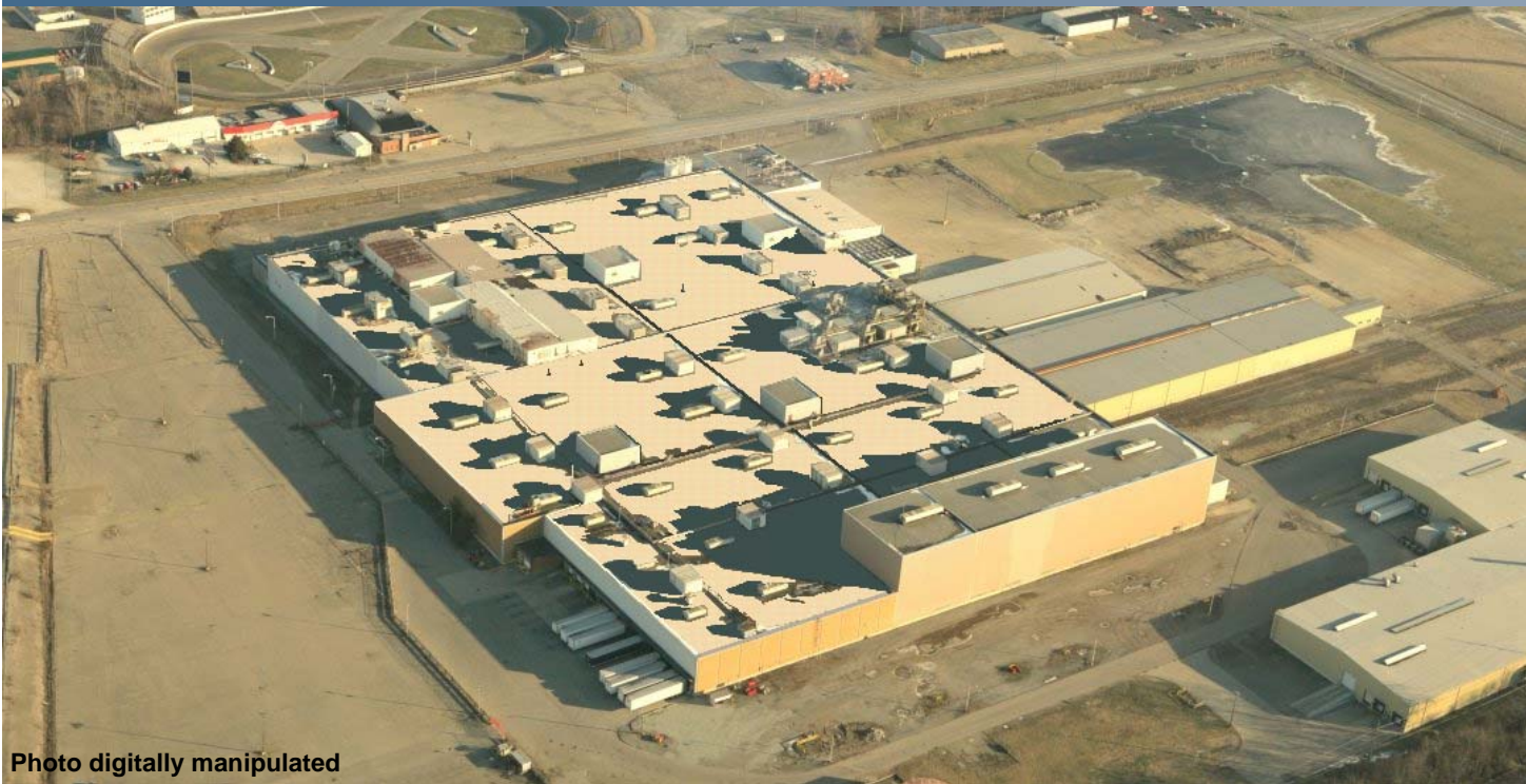
Photo digitally manipulated